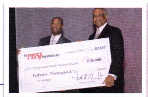
PBS&J donates $15,000 to the BBEO scholarship fund at The Gala 2009