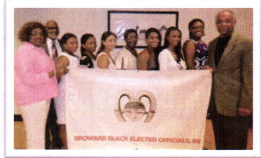
2010 BBEO Scholars with BBEO Board Members